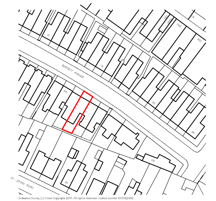
LOCATION PLAN - SCALE 1/1250